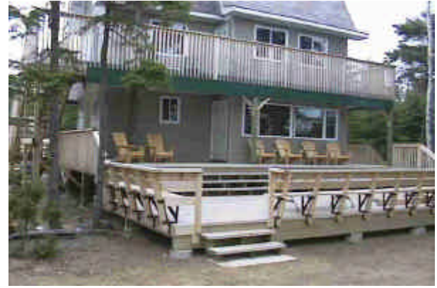
Black's Bay Hunting & Fishing Camp, Main Lodge

Your hunting guide/host/cook will assist in preparation of most meals, but each camp member will be expected to prepare their personal favorites for one breakfast, lunch, and dinner. Be sure to let us know any special ingredients, food allergies, restrictions, etc. that you'll be needing so we can be sure to adjust our shopping list.